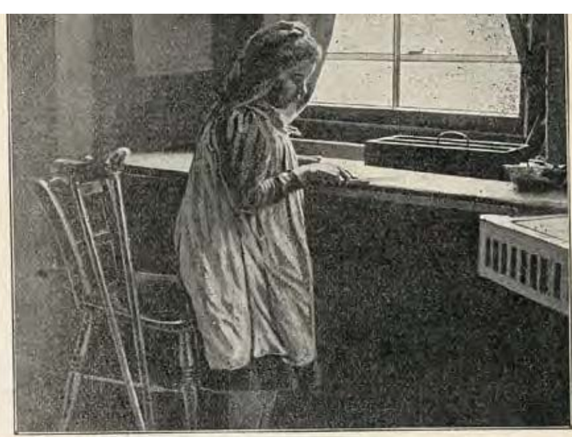
A LITTLE MAID AT ST. AGNES' HOME, CROYDON.

Church of England Waifs and Strays Society, London.